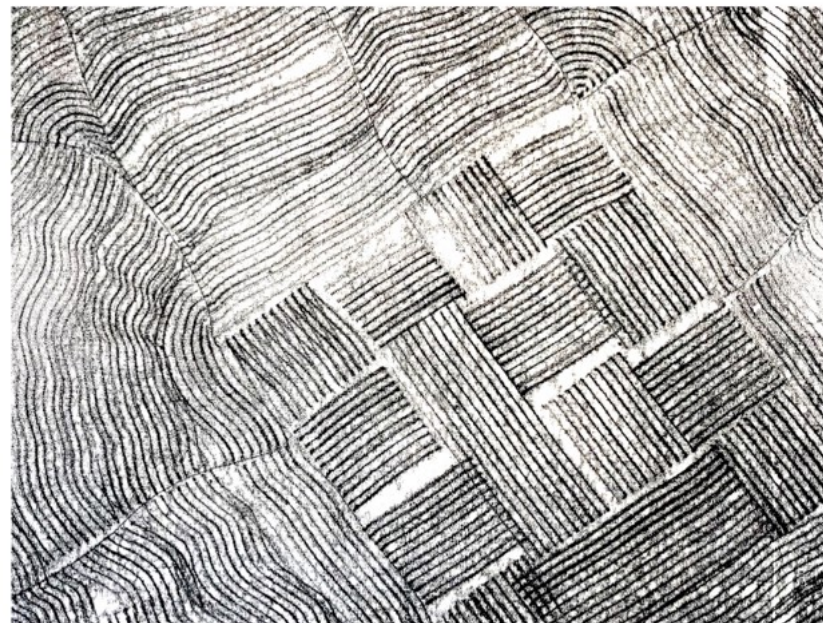
A3 Woven Monoprints